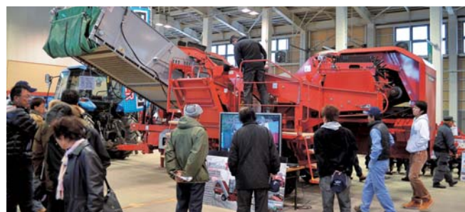
Top: factory tour Bottom: big fair