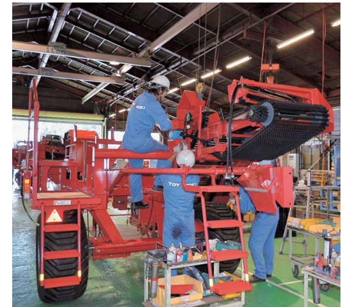
Assembling a machine