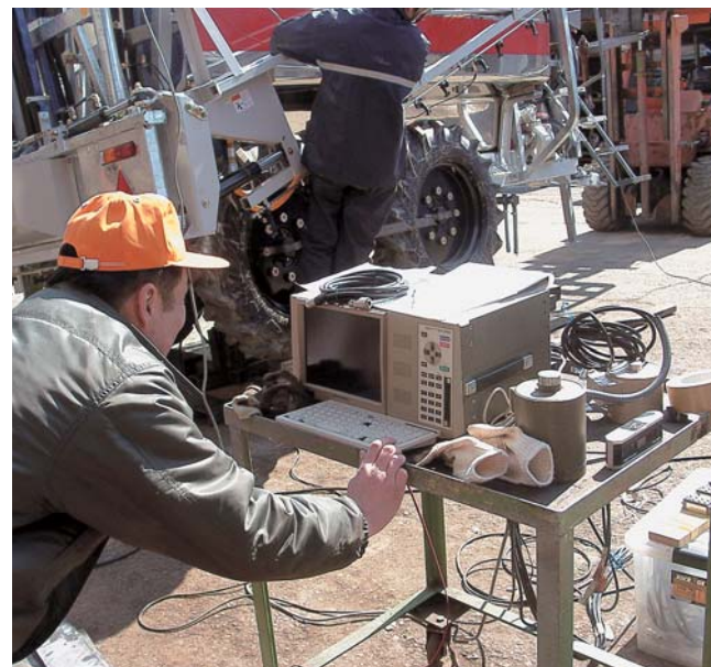
Boom sprayer tipping angle measurement