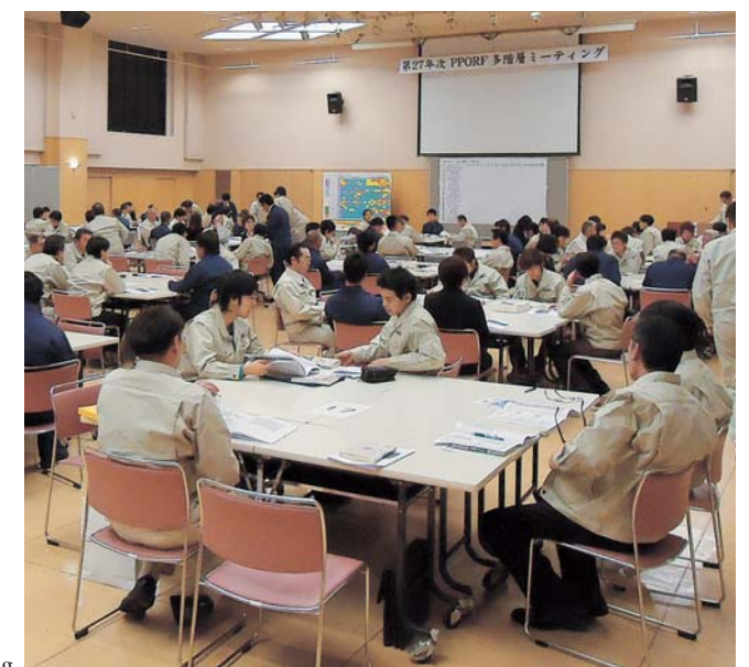
PPORF multilevel meeting

In addition to daily activities based on employee teamwork, an annual multilevel PPORF meeting is held every December to discuss the reform and innovation of commercial operations, set goals for the next year and clarify the direction of the organization's advancement.