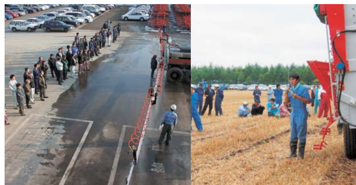
Positive list information meeting

The technology and experience that we as a manufacturer of upland farming machines have accumulated over the years, is utilized in various projects with public institutes. We have proven ourselves in the areas of large scale farming, precision agriculture and environmental preservation.